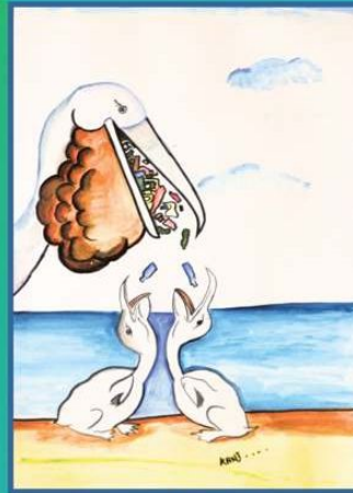
Stop the Pollution Quick, Don't make the Water sick.