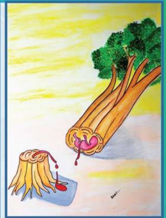
Soil and Tree also have Mother & Child Relationship